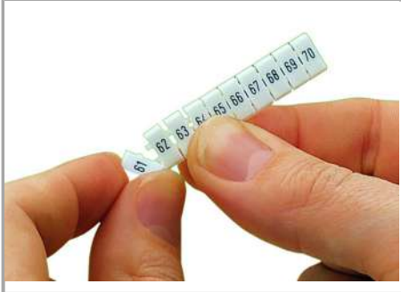
Separating an individual marker from the WMB marker strip – for larger terminal blocks.