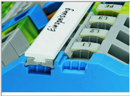
Carrier for WFB Continuous marking strip; to be secured every 10th terminal block.

Subject to changes. Please also observe the further product documentation!