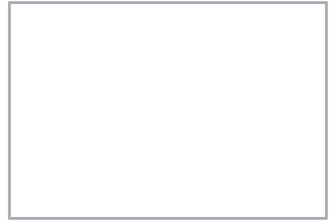
Example of a residential intercom application

Subject to changes. Please also observe the further product documentation!