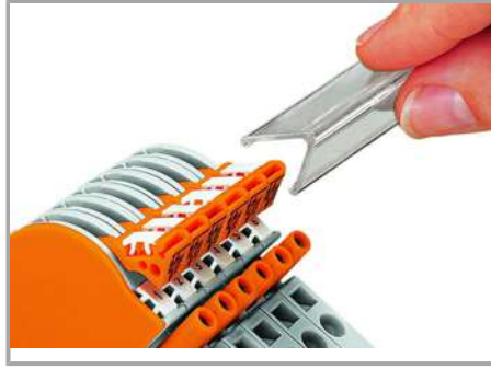
Snapping a transparent locking cover onto 1-8 disconnect links:

a) Mechanically lock several links for multi-pole switching applications