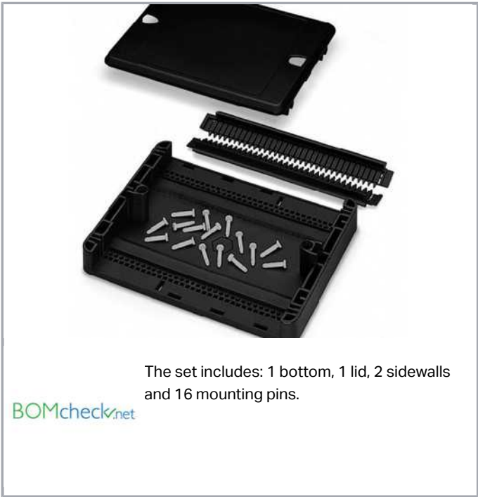
The set includes: 1 bottom, 1 lid, 2 sidewalls and 16 mounting pins.