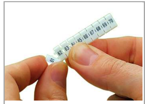
Separating an individual marker from the WMB marker strip – for larger terminal blocks.