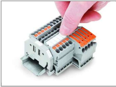
Snapping a marking strip into the marker slot.