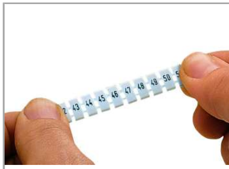
Stretching a WMB marker strip.