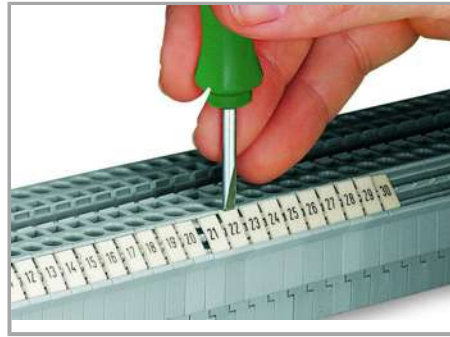
Snapping a marking strip into the marker slot.