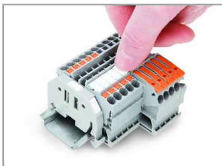
Snapping a marking strip into the marker slot.