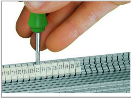
Snapping a WMB marker strip into the marker slot of the double marker carrier.