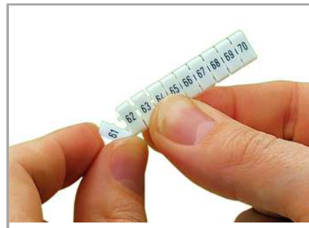
Separating an individual marker from the WMB marker strip – for larger terminal blocks.