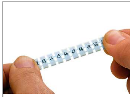
Stretching a WMB marker strip.