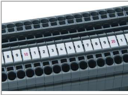
WMB "decade" marking