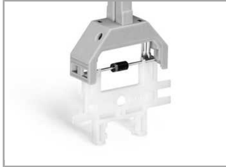
Pressing component into plug contact via operating tool.