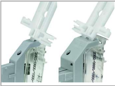
Opening the cover via multi-purpose operating tool for component plugs.

Subject to changes. Please also observe the further product documentation!