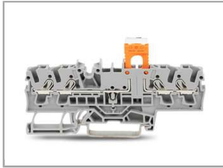
Carrier terminal block (2002-1661) with disconnect plug (2002-401) in parked position