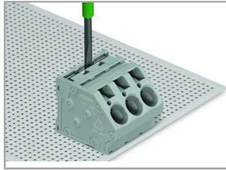
To insert a comb-style jumper bar, push it down using a screwdriver until it hits the backstop – 745 Series.