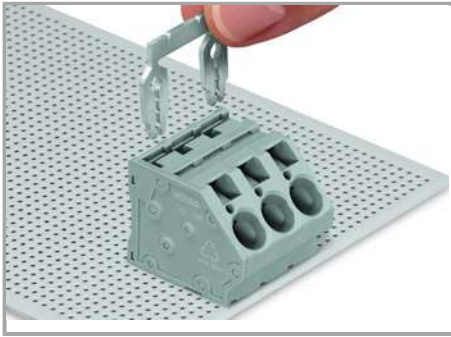
Inserting a comb-style jumper bar.