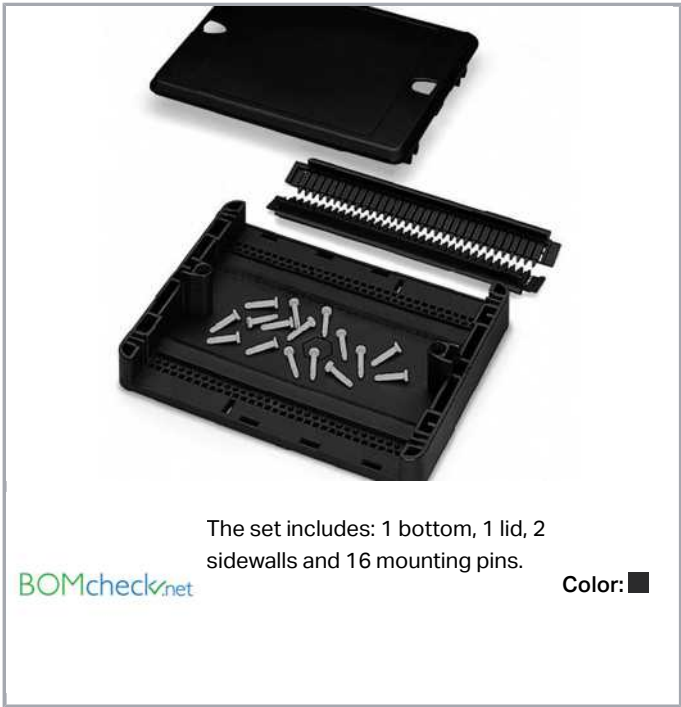
The set includes: 1 bottom, 1 lid, 2 sidewalls and 16 mounting pins.