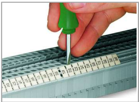
Snapping a WMB marker strip into the marker slot of the double marker carrier.