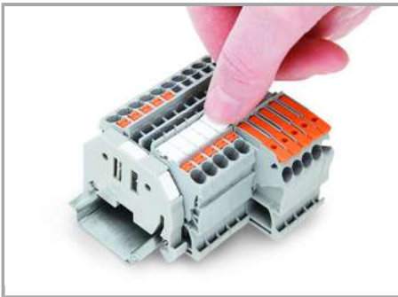
Snapping a marking strip into the marker slot.