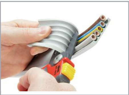
Lift/remove the insulation manually and cut it off with the 897-972 or 897-960 Cable Cutter.

WINSTA® IDC Show all products from the family