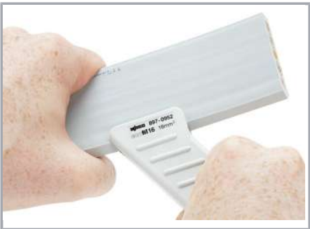
Cut laterally with the stripping knife on both sides (away from the body).