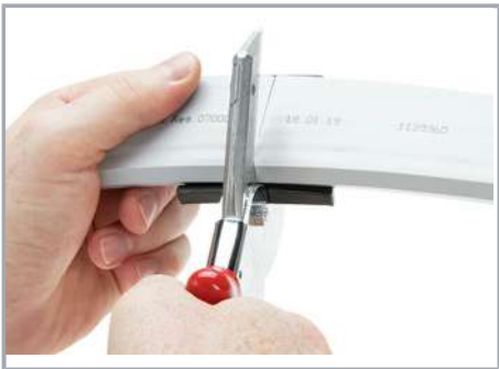
Cut the flat cable with the 897-960 Cable Cutter from side 1 and cut through from side 2.